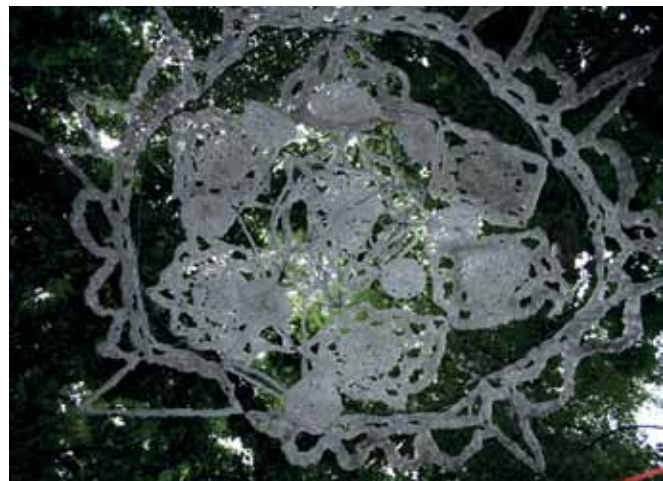
Regina Degiorgis Cúpula plástica 400x400 cm., site specific installation, croché with recycled plastic