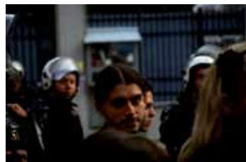
One pair of shoes - One life, photography