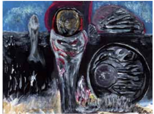
Icon, acrylic on paper, 29,5 x 21 cm