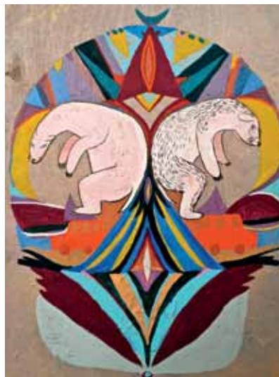
Akvile Miseviciute Inner animal. 20x27 cm, acrylic on wood