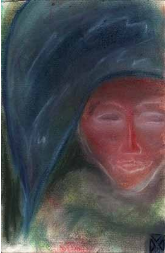
Der Florentiner, pastel on paper, 29,5 x 20,5 cm